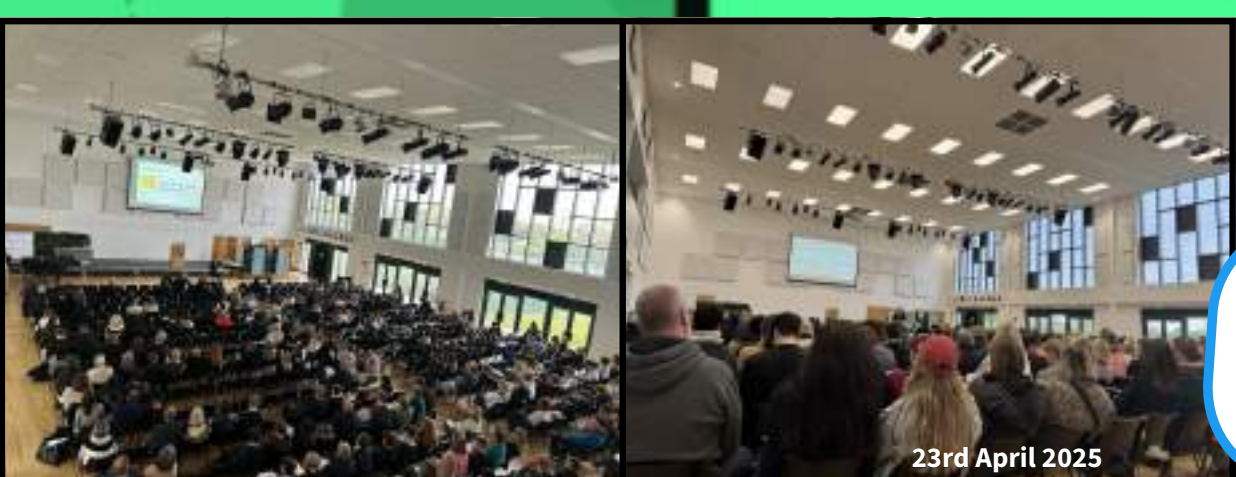
23rd April 2025

ravens_wood_sport Another action packed day! Back training at @realmadrid before heading @warner_bros_madrid theme park. Thanks to sponsors @lsprenewables and NJS Electrical Services for helping the boys to look as smart as their surroundings! Up early and at it again today as we head to the Bernabeu to see some of the best in the game live!