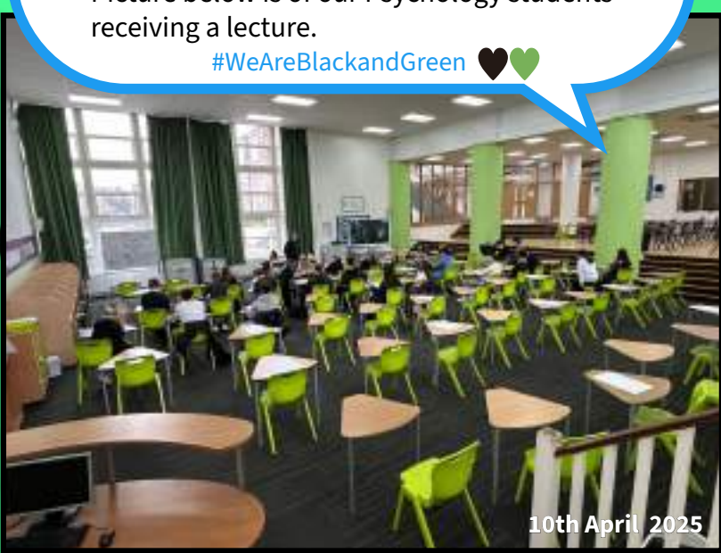
10th April 2025

Ravens Wood School @rw_school The fantastic dedication of our students continues with another great turn out today for Easter School. Well done to Y11 and Y13 students and thanks to our teachers. Picture below is of our Psychology students receiving a lecture. #WeAreBlackandGreen