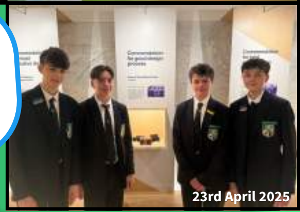
23rd April 2025