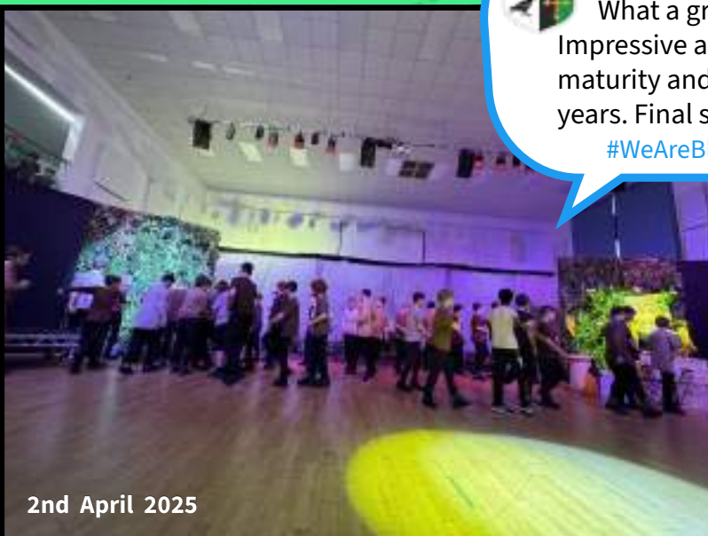
2nd April 2025

Ravens Wood School @rw_school What a great performance! Impressive acting, strong singing and maturity and confidence beyond their years. Final show tomorrow evening! #WeAreBlackandGreen