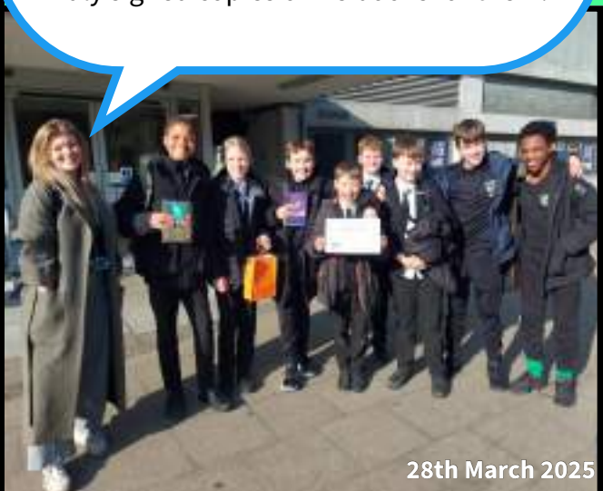
28th March 2025