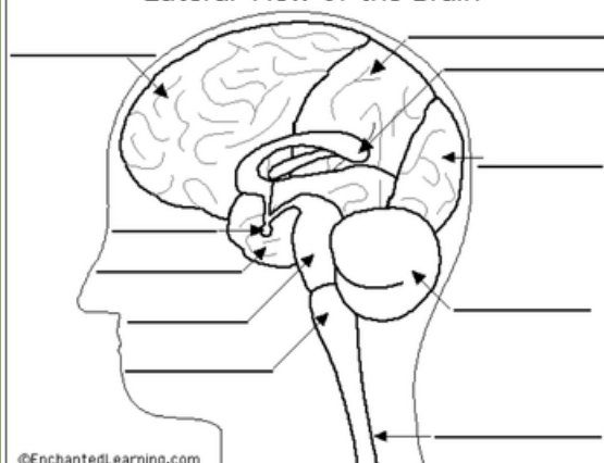
Lateral View of the Brain